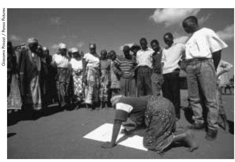
People planning - PRSPs are meant to be owned by governments and their citizens.