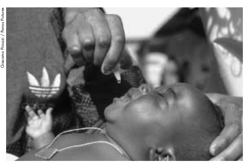
Drop by drop – the UN aims to reduce the proportion of people going hungry by half by 2015.

Deepa Narayan, Voices lead author and principal social development specialist at the World Bank, said: 'Poverty has many dimensions, and they combine to create and sustain powerlessness, lack of voice, and a lack of freedom of choice and action.'<sup>3</sup>