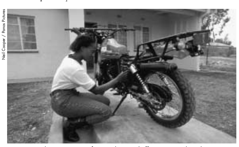
Women's work – 74 per cent of respondents said efforts were made in the PRSP process to encourage women's participation.

The respondents were also asked to say whether their editors felt the media had a role to play in the PRSP. Four answered positively, while two stated that the PRSP process had not been given sufficient publicity.