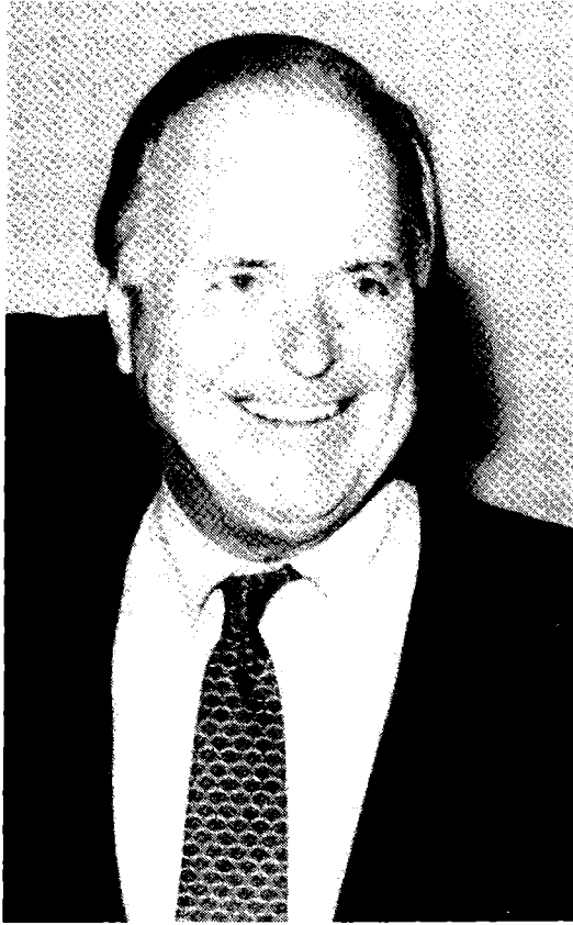
Honorary Chairman of the International Visitors Council of Los Angeles Mayor Richard J. Riordan