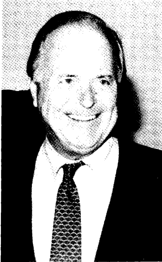
Honorary Chairman of the International Visitors Council of Los Angeles Mayor Richard J. Riordan